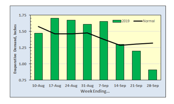
Figure 2. Total weekly evaporative demand for the period 10 August through 28 September 2019. The black line provides the long-term average value for each period.