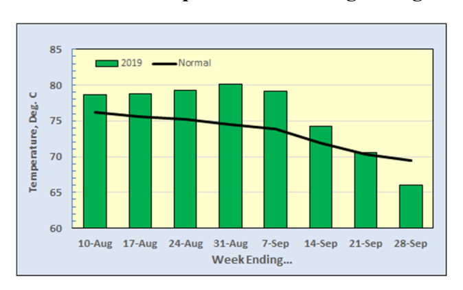
Figure 1. Average weekly air temperature for the period 10 August through 28 September 2019. The black line provides the long-term average value for each period.