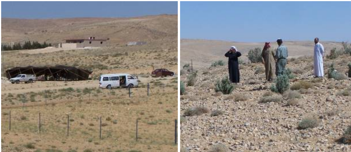
Figure 18 - Tent for field day presentations and participants examining rangeland.