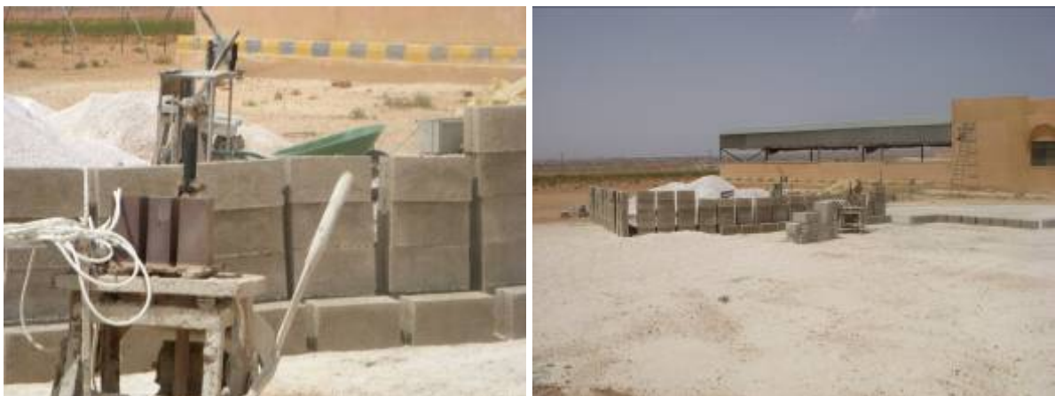
Figure 23 - NMSU & BRDC assessed the feasibility of block manufacturing at the Anaqeed Cooperative