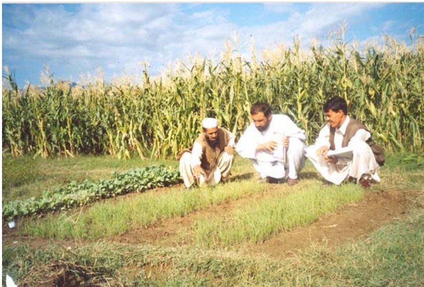
Figure 6 - Northwest Frontier Province Research Station