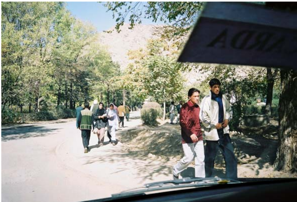
Figure 2 -Students walking on Kabul University

Conducted in Kabul as three separate six-day courses. Participants in group one/course one came from the northern and western provinces, group two came from the southern and eastern regions, and group three was made up of individuals whose duty stations were in the Kabul vicinity.