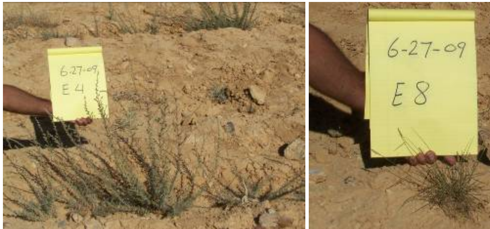
Figure 19 - Very promising varieties of forage kochia ( Kochia prostrata ) and Siberian wheatgrass ( Agropyron fragile ). Two year's growth from seed with less than 100 mm of annual precipitation.