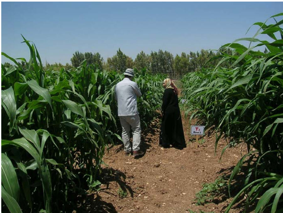
Figure 11 - Reuse of Treated Wastewater and Biosolids