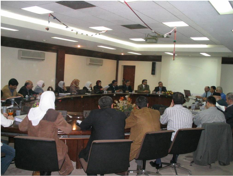
Figure 9 - Biosolids ad hoc Committee Technical Session