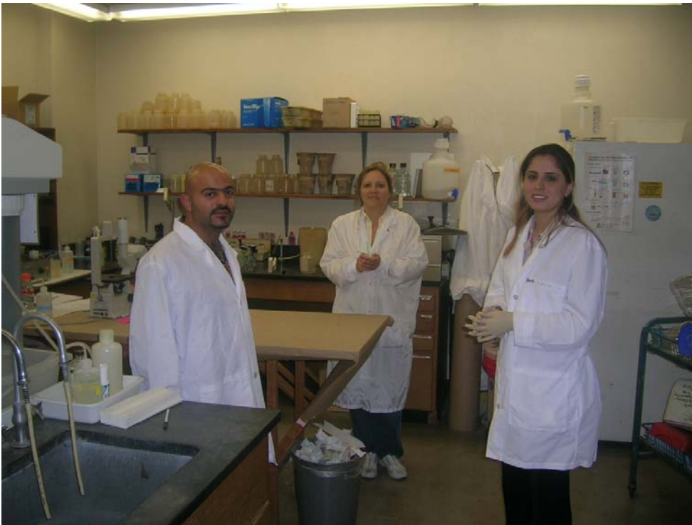
Figure 8 - Capacity Building: Virology Training