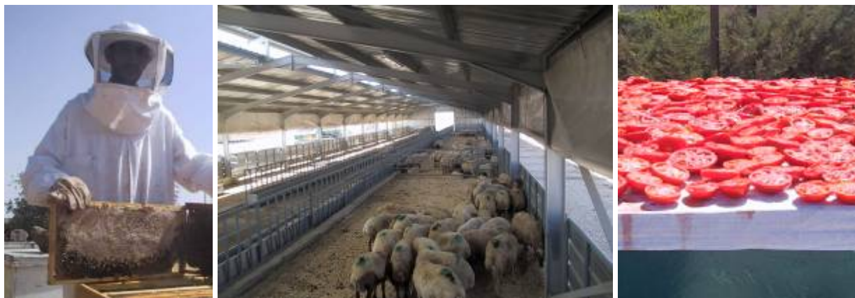
Figure 20 - NMSU & BRDC assessed the financial performance of the agricultural business ventures of the Anaheed Cooperative