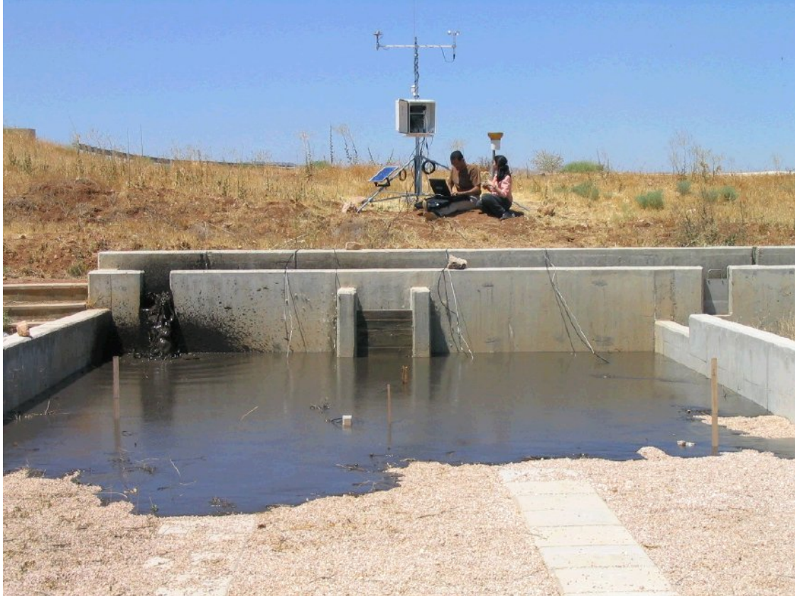
Figure 10 - Biosolids Technology Monitoring