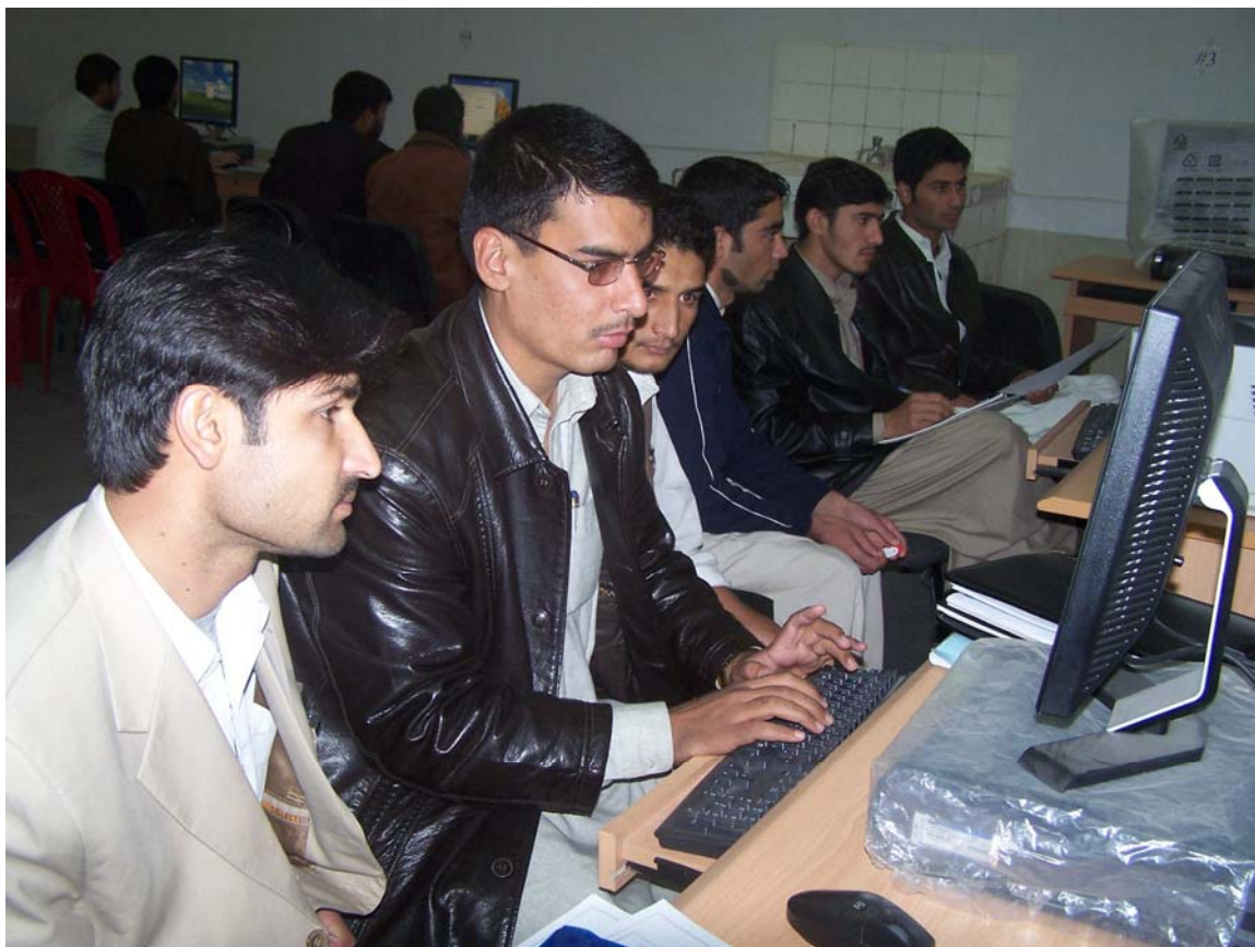
Figure 28 - Students of the college of agriculture in Nangarhar University in training to use TEEAL made available through the initial work at the Technology Training and Learning Center late in 2007.