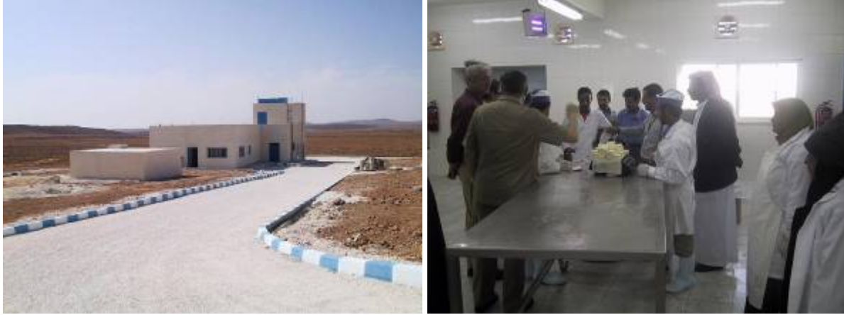
Figure 21 - NMSU & BRDC assessed the financial performance of the sheep milk cheese processing plant at the Tal-Rimah Cooperative