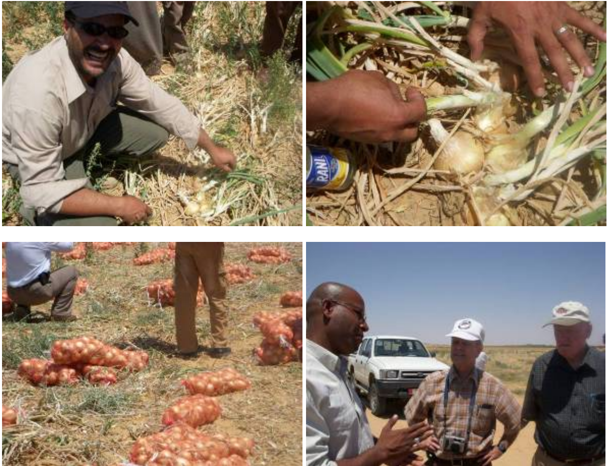
Figure 25 - Sweet onion trials on Sheikh Khalid farms in Al Mudawwara