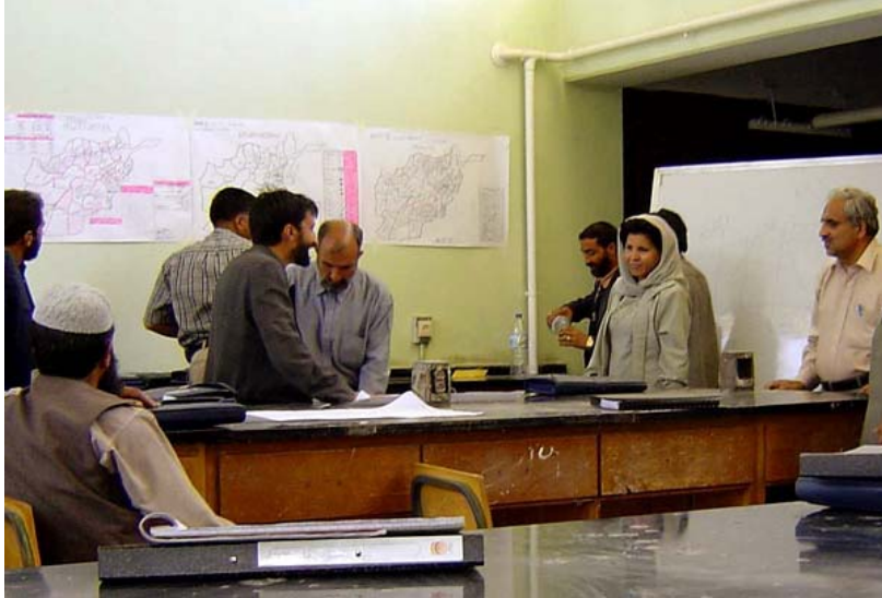
Figure 3 - Enterprise Development and Management Skills Classroom