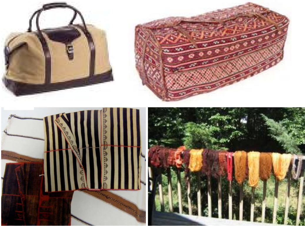
Figure 27 - Representative products that might be produced by Jordanian fiber artists