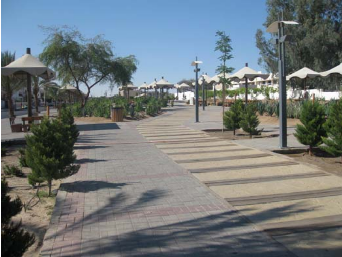
Figure 13 - Implementation of Xeriscape Design Elements