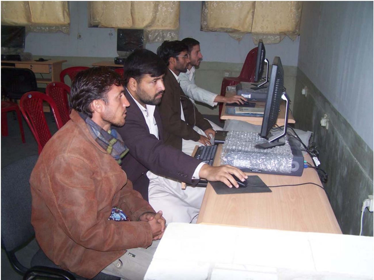
Figure 29- Another group of students of the college of agriculture in Nangarhar University in training to use TEEAL made available through the initial work at the Technology Training and Learning Center late in 2007.