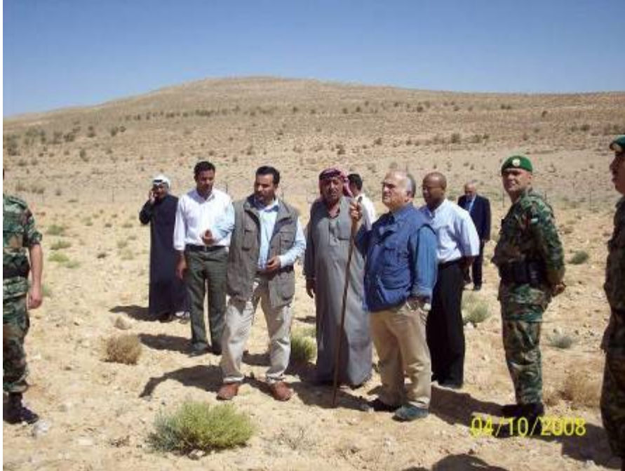
Figure 17 - Tour of Qurain cooperative research NMSU and BRDC rangeland restoration site by Prince Hussain.