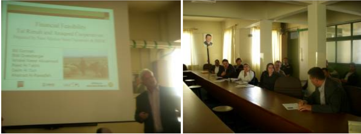
Figure 24 - Seminar at Al Al-Bayt University on financial results of feasibility studies of Anaqeed and Tal-Rimah projects