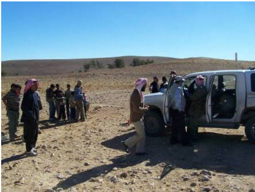
Figure 16 - Community involvement of rangeland research restoration research and demonstration with NMSU and BRDC.