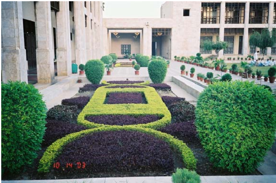
Figure 4 - Northwest Frontier Province Agricultural University in Peshawar, Pakistan