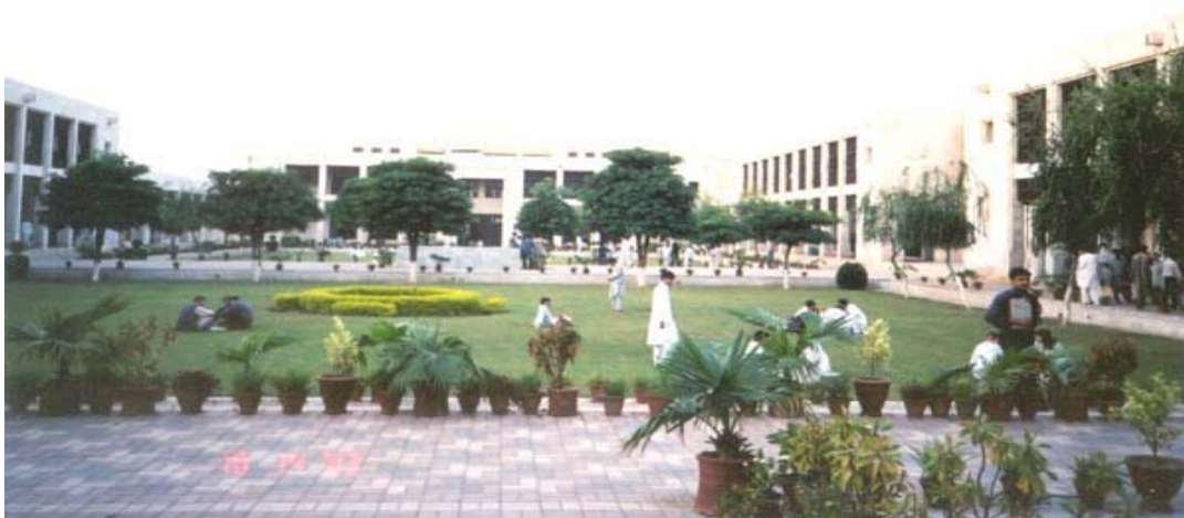
Figure 5 - Northwest Frontier Province Agricultural University in Peshawar, Pakistan