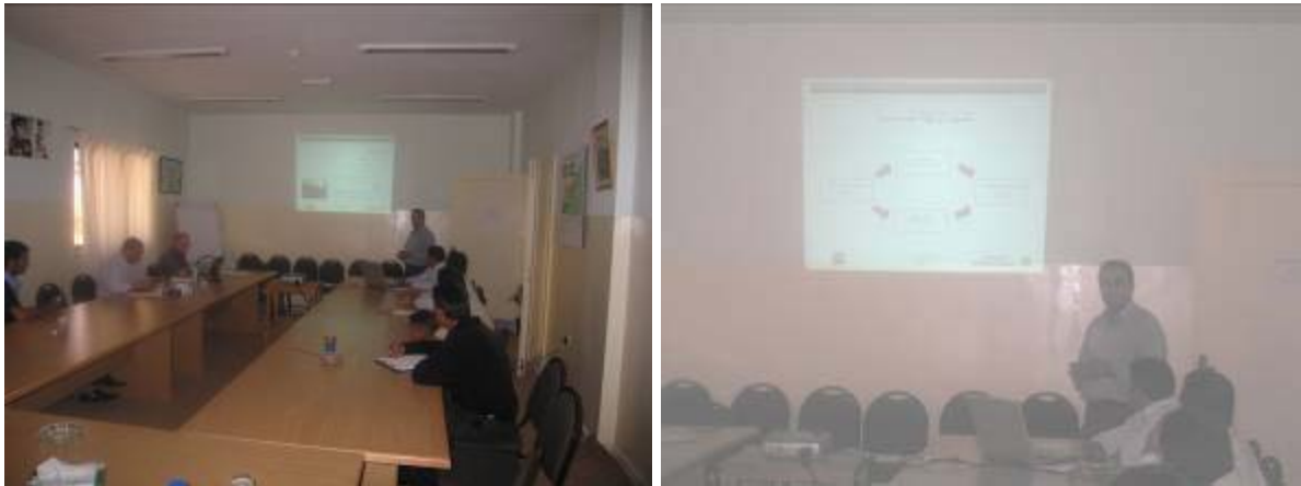
Figure 22 - Financial performance seminar for members of Anaqeed and Tal-Rimah cooperatives