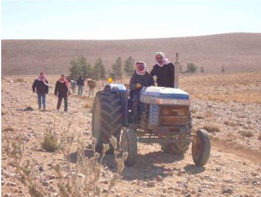
Figure 15 - Rangeland restoration activities of New Mexico State University and BRDC in Jordan: Evaluation of seeding and water harvesting practices in Qurain.