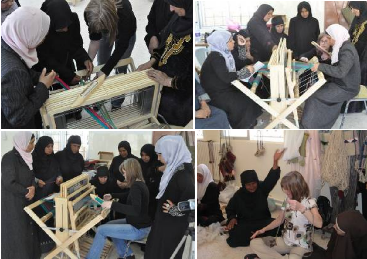
Figure 26 - Training conducted at the Jordanian Women's Qualifying and Training Society in Udreh