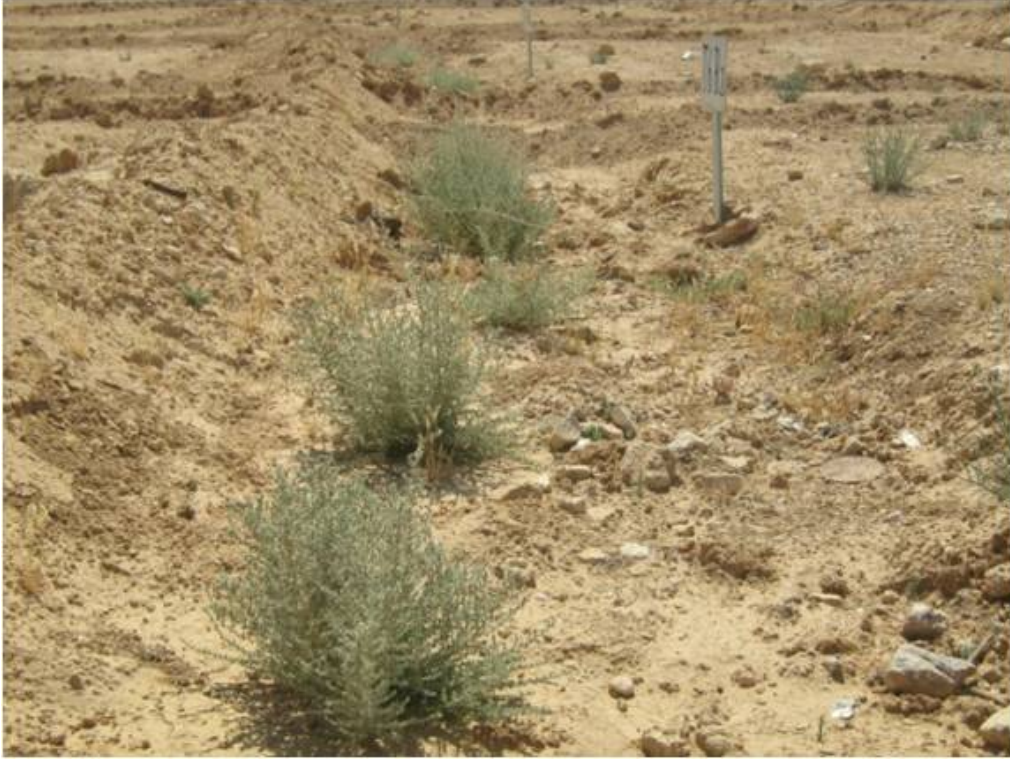
Figure 12 - Rangeland Restoration with Biosolids