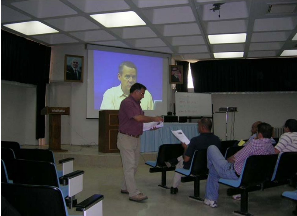
Figure 7 - Real-Time Distance Learning