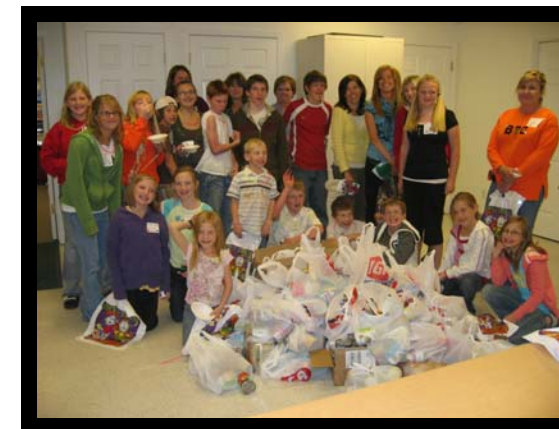
Treat or Treat SO Others Can Eat