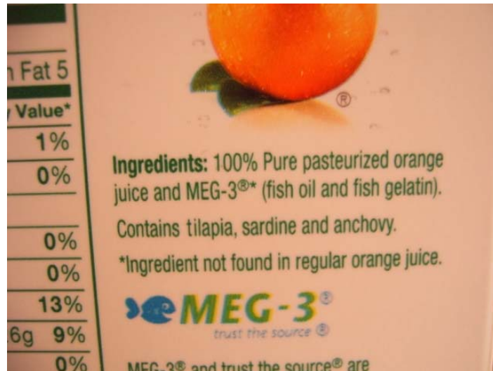
Figure 4. Orange juice fortified with omega 3 tilapia fish oil.