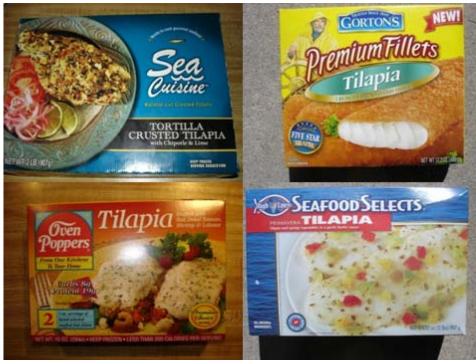
Figure 2. Packages for various tilapia value added products.

By-products – The variety of products recovered from processing obviously depends on the form of tilapia goods prepared for sale. Whole frozen or fresh on ice fish will have little to offer. However, fillet products generate considerable waste which can be turned into valuable products. Tilapia leather goods have become a side industry in Brazil producing wallets, belts, purses, briefcases, vests and other articles of clothing. Skins are trimmed to common size and shape, tanned in typical leather making techniques, dyed a variety of colors, sewn together, and assembled into a number of goods.