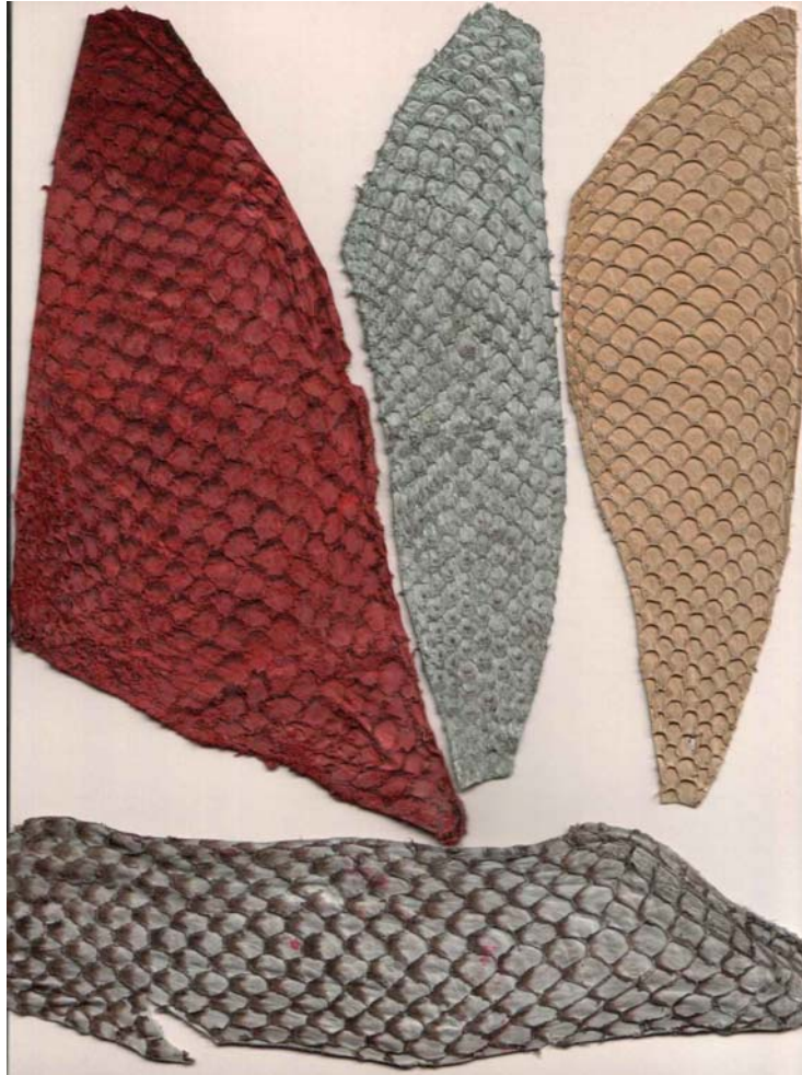
Figure 3. Tilapia skins tanned and dyed various colors.

Another important by-product is collagen collected from the inside of skins. Several countries in Europe have turned to tilapia and other fish skins to replace mammalian collagen sources due to concerns over Bovine Spongiform Encephalopathy (BSE) or Mad Cow disease. Apparently, the fish collagen can be used for preparation of time release capsules for various medicines. Skins are collected and stored in frozen blocks or salted and stored. This may be a difficult market for new entry as several farms in Central America have long supplied pharmaceutical firms in the EU with product.