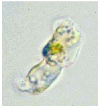
Two P. parvum cells preying on and ingesting one dinoflagellate cell ( Heterocapsa rotunda , the green in the center of the picture). http://www.alf.homepage.dk/Framesets/FramesetPhotos/Photoshome.html .

On June 30 th 2005, we attended a meeting with AzG&F and ADEQ to discuss our current state of knowledge regarding algal toxins in general, which direction future