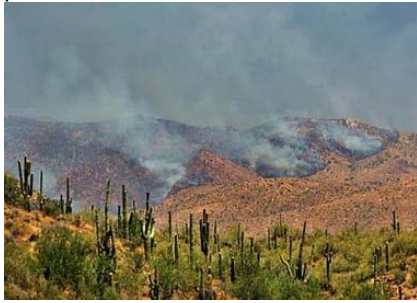
The CCC fire rolling over desert hills. This is in stark contrast to the type and amount of vegetation ("fuel") burned during the Rodeo-Chedeski fire.

and may never fully recover to post-fire status.