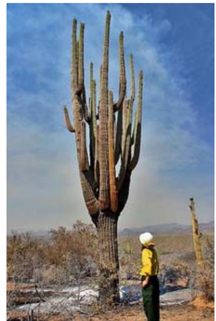
Tonto NF Fire Prevention Officer Courtney Baughman inspects a saguaro partially burned in the CCC fire. Saguaros, like most Sonoran desert plants, have no adaptation(s) to protect themselves from wildfire.

Needless to say, the type and amount of vegetation in all watersheds, including those surrounding the Valley, have direct and indirect impacts on water quality delivered to the reservoirs and, ultimately, to treatment plants in the Valley. Vegetation type also determines post-fire impacts to receiving water bodies. Invasive plant species have the potential to increase fire frequency as well as add fuel to areas where, typically, wildfires have never occurred. I whole-heartedly agree, it's time for a state Department of Invasive Species Control to deal with issues such as invasive plants, both terrestrial and aquatic including potentially toxic species of algae.