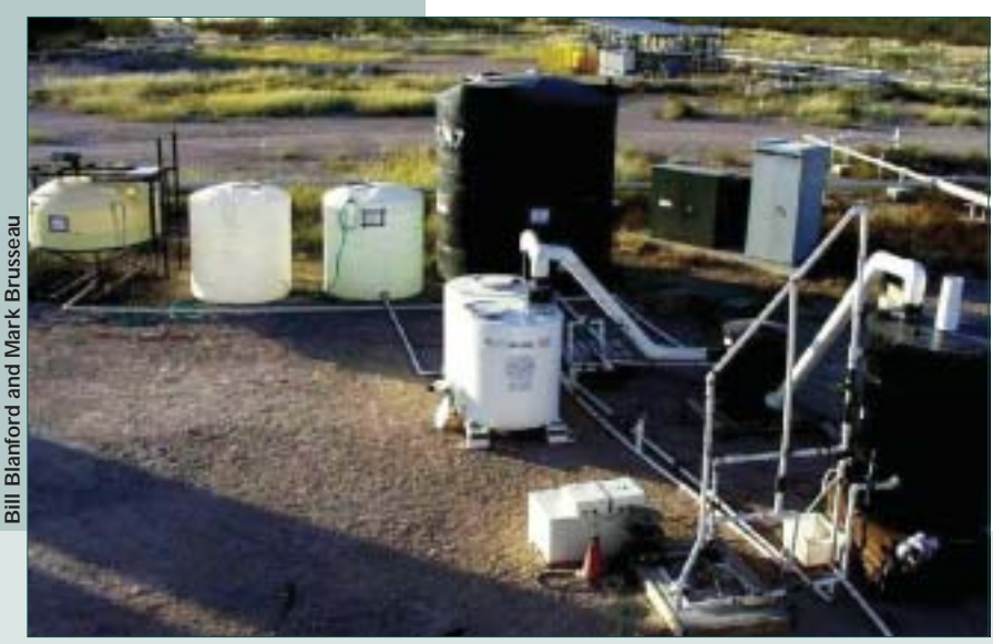
This is an example of an actual cyclodextrin vertical flushing system that was used at a contaminated site.

Every project is a collaborative effort involving university scientists, industry managers and government agency officials. Brusseau's role is to analyze the character of each spill. He identifies the specific processes