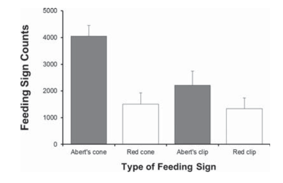
Figure 1 – Total number (n) of feeding signs for invasive Abert's squirrels (grey: Sciurus aberti ) and endangered Mount Graham red squirrels (white: Tamiasciurus fremonti grahamensis ) collected; broken down by cones and clippings, Pinaleno Mountains, Arizona. Abert's squirrel signs were 11.08 times higher on all sign transects than red squirrel signs (95%CI=3.18 to 38).

rel clippings were 3.4 times more abundant in burned areas than in unburned areas. The opposite pattern was true of red squirrels with clippings being 39.4 times lower on burned areas than on unburned areas.