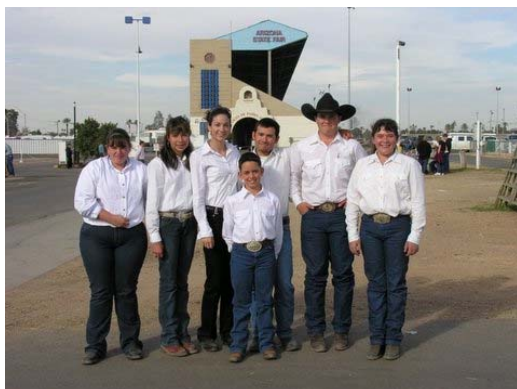
THE BIG DAY!!!