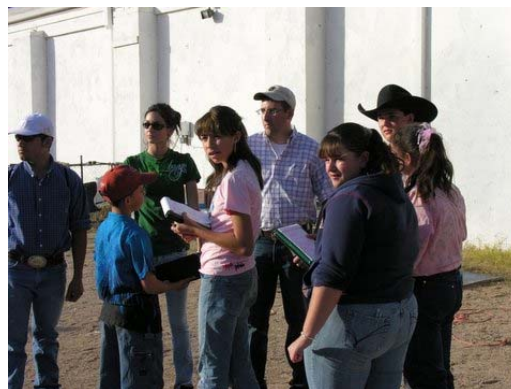
PRACTICING THE DAY BEFORE!!!