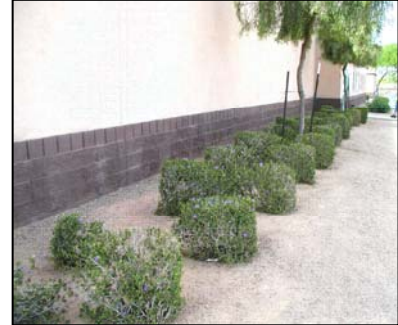
Hedgerows pruned away from buildings help prevent pest access.

Excluding pests often involves performing maintenance upgrades, such as installing door sweeps and replacing worn out thresholds. Many of the maintenance issues addressed for pest exclusion have secondary benefits to energy cooling/heating efficiency, improved structural integrity, and the prevention of more extensive repairs down the road. Good IPM practices benefit schools in many ways! Habitat manipulation might also be used to discourage pests from an area. For example, trimming trees away from buildings reduces opportunities for insects and other arthropods to access eaves, rooftops, and similar areas that may serve as entry points.