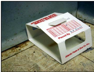
Monitoring traps provide early detection of possible pest problems

Biological control involves employing an organism to help control the population of a pest. It is used less often in urban/school environments; however, one familiar example is “mosquito dunks” which are an over-the-counter product that contain bacteria lethal to mosquito larvae. Reduced-risk chemical pesticides are used when necessary, but overall applications drop dramatically when the other IPM measures are in place. Few “sprays” are ever used and pesticides are usually formulated and applied using other methods, such as target-specific baits. Pest control materials are selected and applied in a manner that minimizes risks to human health, non-target organisms and the environment. Outdoor pest management efforts are carried out with the goal of removing only the target organism , keeping in mind that the vast majority of outdoor life benefits our soil and plants.