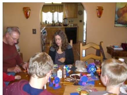
The Spears family hosted and supplied the materials to make about 80 stand-up foam crosses that we took to the VA Hospital and sang Christmas Carols on Christmas Eve!