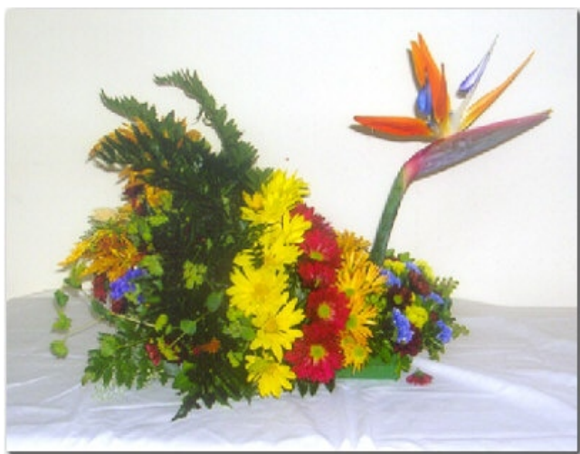
Floral Thanksgiving turkey from www.sprigs.com