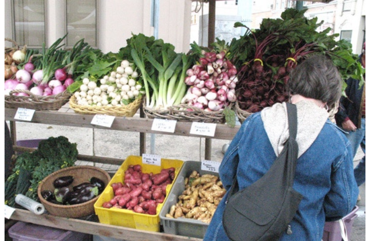
Astoria, Oregon farmers market

This farmers marker is really dedicated to local farmers. Craft sellers and and non-farm items are limited, so if you want farm items this is the place to go.