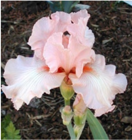
Iris "Beverly Sills"

Arizona Cooperative Extension Yavapai County 840 Rodeo Dr. Building C Prescott, AZ 86305