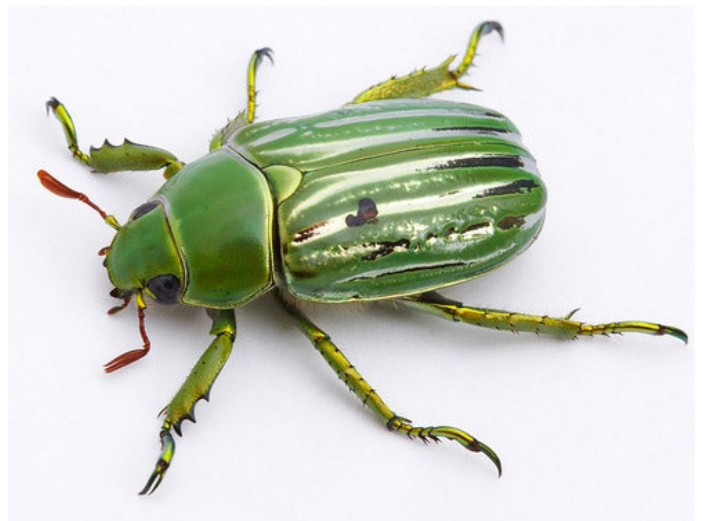
The Glorious Beetle, Plusiotis gloriosa found in Jerome, Arizona this year.

Although this seems to have been a poor gardening year, if you have extra fruits and vegetables consider giving some to your local food bank.