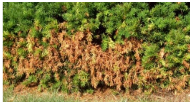
Herbicide damage on a yew.