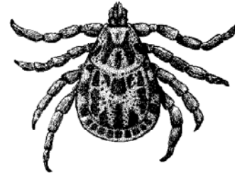
Adult female Rocky Mountain Wood tick 3 times actual size

and crevices. They have a tendency to climb, and indoors they may hide high on walls. Vacuuming both high and low, cleaning curtains, and frequent laundering of pet bedding can often be sufficient to control ticks indoors. In more serious infestations pesticides can be applied to likely hiding places. This may require a professional pest control service.