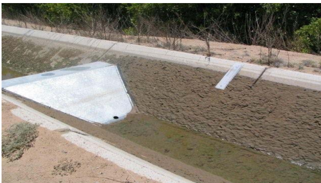
Portable flumes installed in farm water supply channels provides irrigators with a capability to better control the water supply to their irrigation basins