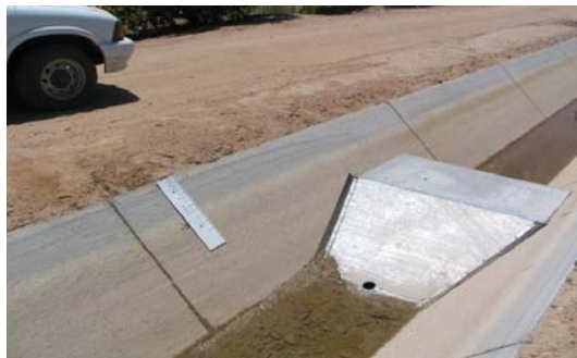
Water measuring flume installed in the field water supply channel of a grower's farm to help raise irrigation application efficiency