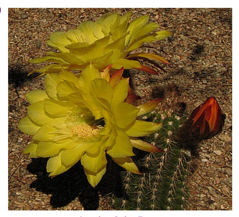
Jewels of the Desert Click here to view a short musical slide show.

Other simple measures include keeping plants well watered and mowing grass and weed areas