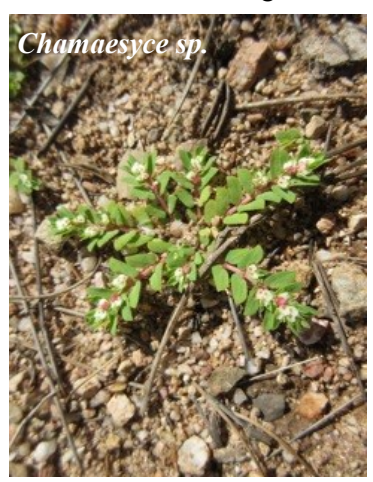
(Continued on page 6)

Chamaesyce sp., sandmat, is a group of mostly prostrate euphorbs which have been reassigned to the