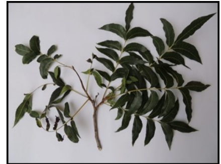
Pecan Bacterial Leaf Scorch (PBLs) on the terminal shoot of this limb. Notice the secondary shoot has no symptoms that it spreads through the xylem.

Currently, there is no treatment to recommend for these bacteria. All cultivars are susceptible to it as well. The goal then is to identify what is spreading the disease first, then we will work on a realistic and economical approach to suppressing its severity.