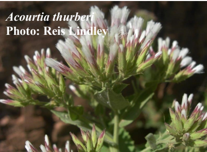
Acourtia thurberi

Acourtia thurberi is an astoundingly beautiful robust herbaceous perennial with holly-edged leaves and large pink flower heads - the queen of rocky granitic oak grassland hillsides above drainages or ethereal streams. Related to the little Desert Holly with similar honey-smelling flowers...but this one has bigger heads with more flowers atop stems that reach 3 - 4'. A heaven and haven for innumerable insects... many butterflies!! After a spectacular bloom, there is another fall show as the sun glows through the pure white seed plumes.