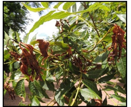
Pecan Bacterial Leaf Scorch (PBLs) on the terminal shoot.