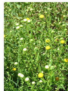
Grindelia nuda var. aphanactis

plant are resinous, and are believed to help congested breathing.