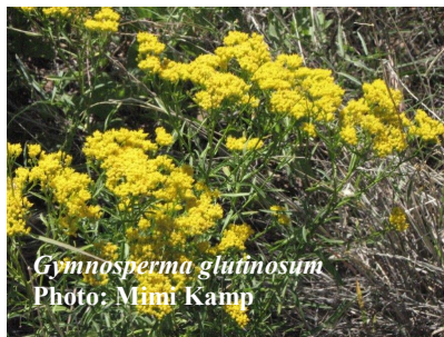
Gymnosperma glutinosum

Gymnosperma glutinosum (formerly Selloa glutinosa ) has impressed me as a potentially excellent landscape plant. It seems to hold its own from arid desert scrub grassland to oak and pinon/juniper grassland. Often found on rocky hillsides in sandy or gravelly soil, it is a well-balanced and woody plant to 2' tall or more that looks good though drought and becomes glorious with rain. The linear leaves are a glowing green, slightly resinous, with dense compact small-flowered heads of rich yellow. Without having propagated it myself, I'd like to suggest that we might collect seed and give it a try! Does anyone have a skill with cuttings? How bout it? Up to the maples, down to the creosote – such a range of habitat and elevation make Tatalencho a good candidate for survivability through climate changes. In Mexico, leaves are put in shoes for sore feet and rubbed on ant bites.