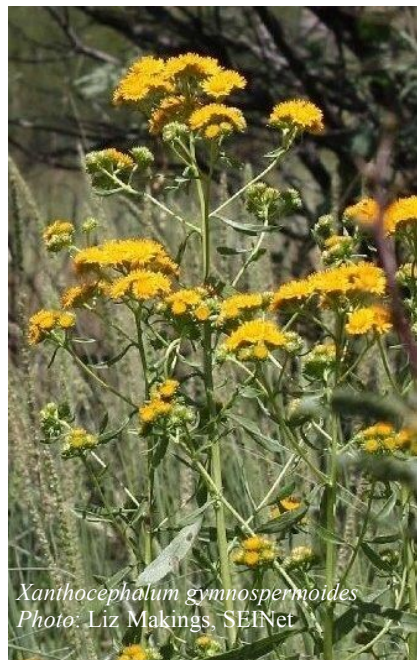
Xanthocephalum gymnospermoides

Xanthocephalum gymnospermoides (also known as Gummy Broomweed and Gummy Snakeweed), is a rich golden-flowered resinous annual of lowland, flat meadows, in moist soils at least during the monsoon. An annual to 3' tall or a bit more, it is showy, even spectacular, in its typically massive dense stands – a sea of gold appears at the end of summer in an otherwise quiet and uneventful landscape. The sticky resinous flowers, though not large, are densely grouped in heads at the tops of the plants. The name 'Matchweed' refers to dried stems apparently having been used in kindling fires as the resin makes them especially flammable. This show is visible now near the Brown Canyon Ranch, around Naco, and most likely in areas around the river.